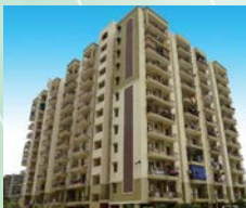
SG IMPRESSIONS 58 RAJNAGAR EXTN., GHAZIABAD