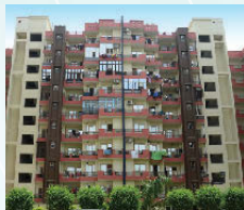
SG IMPRESSIONS SEC-4B, VASUNDHARA, GHAZIABAD