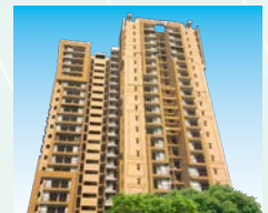
SG OASIS SECTOR-2B, VASUNDHARA GHAZIABAD UPRERAPRJ877