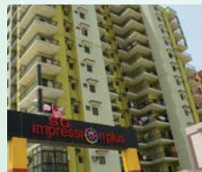
SG IMPRESSIONS PLUS RAJNAGAR EXTN., GHAZIABAD