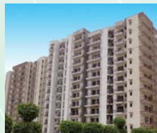
SG IMPRESSIONS 58 PHASE-2, RAJNAGAR EXTN., GHAZIABAD