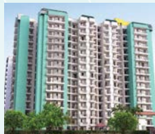
SG HOMES SEC-3, VASUNDHARA, GHAZIABAD