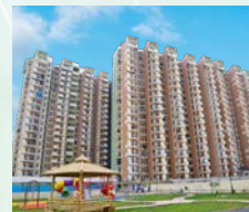
SG GRAND RAJNAGAR EXTN. GHAZIABAD UPRERAPRJ2513