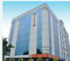
SG ALPHA TOWER SEC-9, VASUNDHARA, GHAZIABAD COMMERCIAL