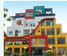
SG BETA TOWER SEC-3, VASUNDHARA, GHAZIABAD COMMERCIAL